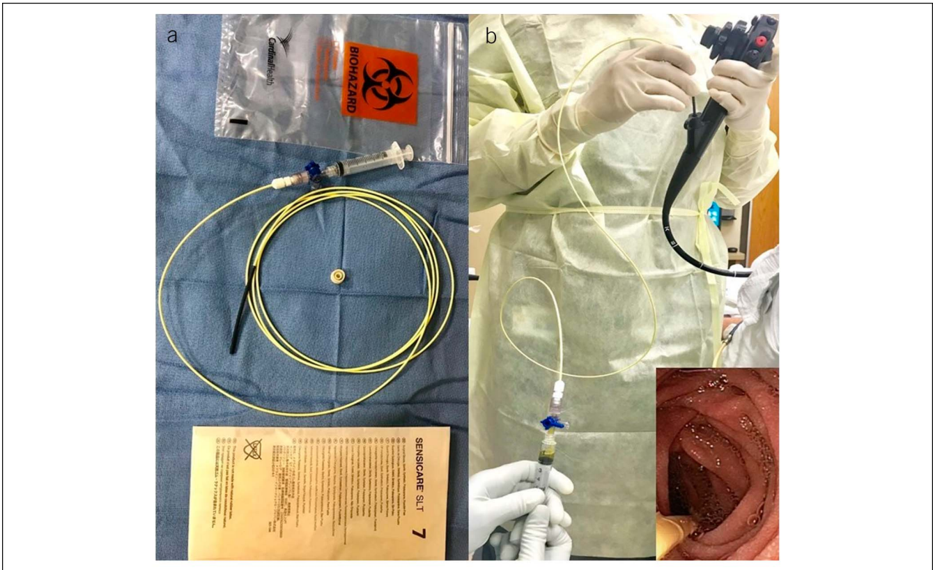
Figure 1. Description of the procedure for duodenal aspiration, specimen collection, and handling: The technician flushes the scope with sterile water and prepares a sterile field. A Liguory catheter with a stopcock is assembled (a). The scope is passed into the second/third portion of the duodenum with minimal air insufflation and suctioning. The endoscopist and the technician wear sterile gloves and advance the Liguory catheter through the biopsy channel. The technician performs gravity-assisted aspiration by holding the syringe at a height lower than the patient to aid fluid flow. Using gentle suction, ~3 mL of duodenal fluid is collected and immediately transferred to the microbiology laboratory (b).

acid plates are held in oxygen for 48 hours before being discarded. Anaerobic media are incubated under anaerobic conditions for 5 days. Any bacterial growth \geq 1,000 cfu/mL is identified and reported out using colony count numeration. The organisms (i.e., Neisseria sp, Gram-positive bacilli resembling diphtheroids/coryneforms, Lactobacillus species, Streptococcus viridans group, Staphylococcus coagulase negative, and Rothia sp.) are identified based on gram stain, colonial morphology, or spot tests. Whenever appropriate, antibiotic susceptibility panels are performed and reported (17).